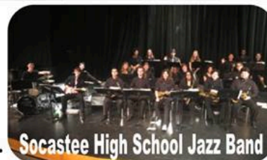
Socastee High School Jazz Band

Located at the corner of Kings Hwy & 16th Ave. N.